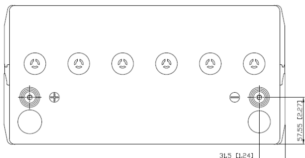
Detail A Drawing(4:1)